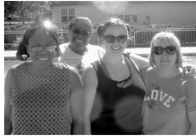
Part of our Welcoming/Social Committee at our Pool Opening Party in May.